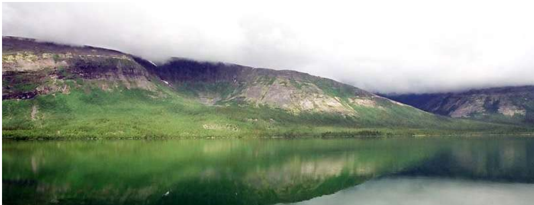
Seidozero Lake, Lovozero Tundras