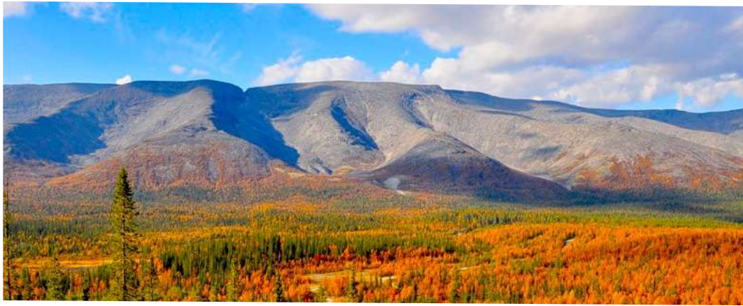
View at Geographers Gorge, Khibiny Tundras